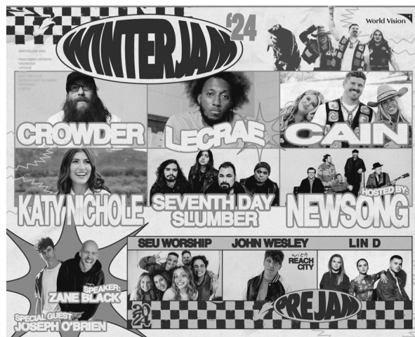
Youth Winter Jam Saturday February 7, 2024